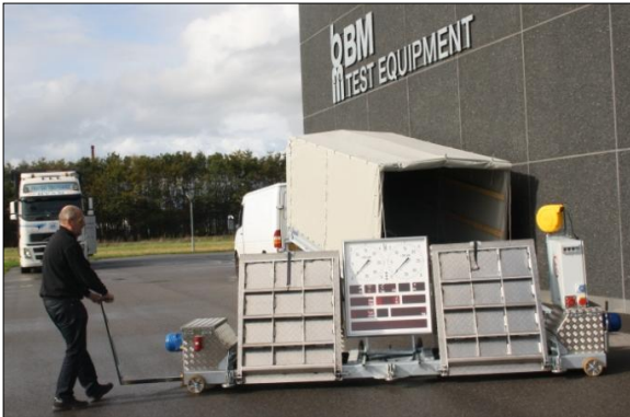
Unique trolley device enabling a one man setup time of less than 10 mins.

Customers who consider becoming an ATF are encouraged to check the models on the GEA's current list at http://gea.co.uk/lib.asp and to watch the video on our YouTube channel, ' BMTestEquipment '.